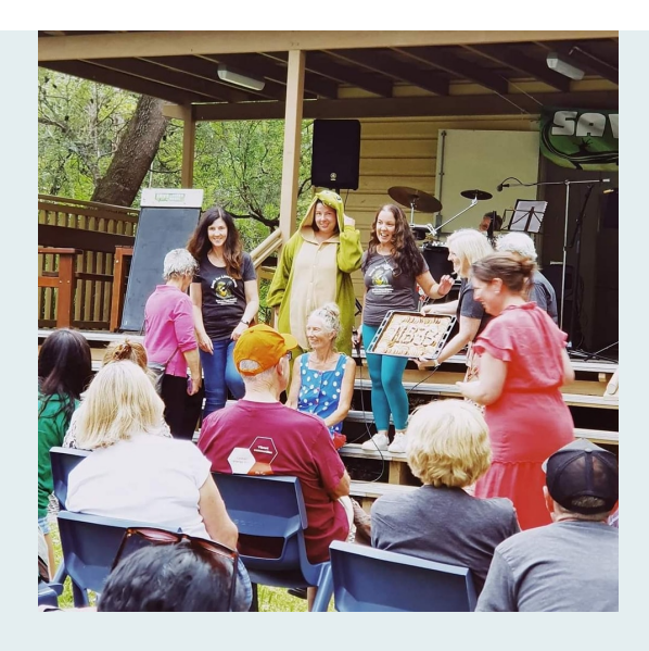
Donning the Lizard suit with the Northern Beaches Bushland Guardians at "Rock for Lizard Rock" to celebrate reaching the milestone of 10,000 signatures on the petition to save Lizard Rock. We're now up to 12,000 signatures!