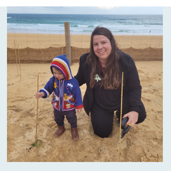
Helping the Harbord Scouts out with bush regeneration at the Nth Curl Curl dune