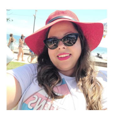
Attended the annual Pride Picnic hosted by Fusion Pride