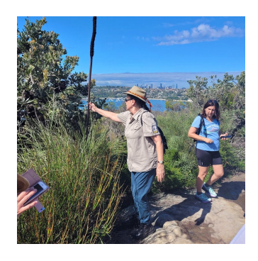
Attended the Aboriginal Heritage Office history and nature tour