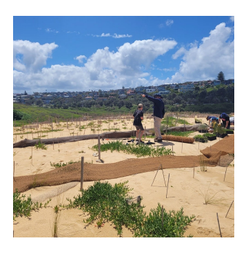
Helped out with the Council + Scouts doing bush regen at Curl Curl dune