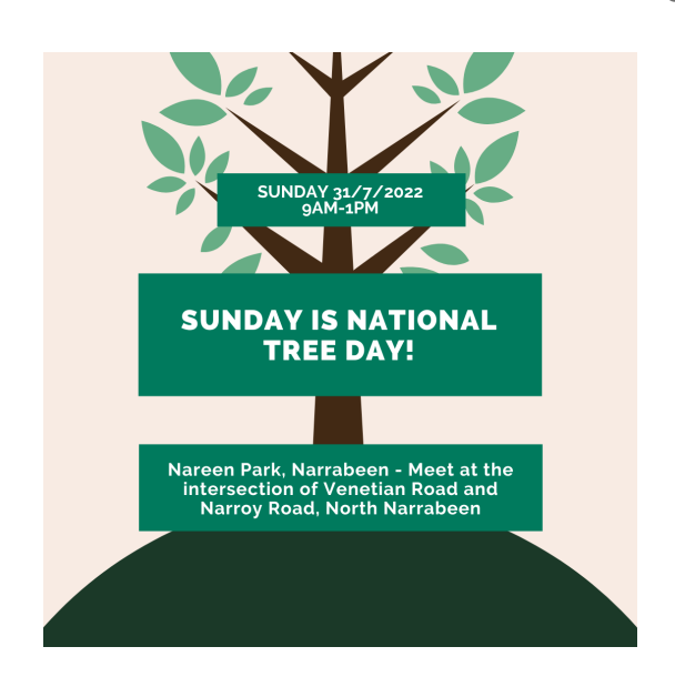
Sunday 31 July 9AM-1PM

These are not Greens events but are great local events worth attending:)