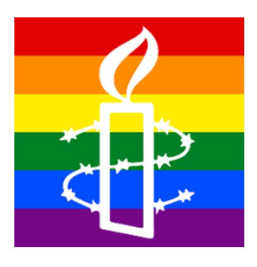
Thursday 28 July 6.30PM

This Sunday is National Tree Day! Council in conjunction with Planet Art are hosting a tree planting 9am1pm this Sunday 31/7/22 at Nareen Park, Narrabeen - Meet at the intersection of Venetian Road and Narroy Road, North Narrabeen.Come along to plant a new baby tree and meet other locals who care about nature Find out more at: