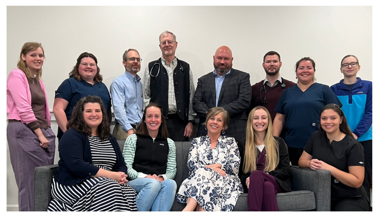
Thank you for allowing us to care for you!