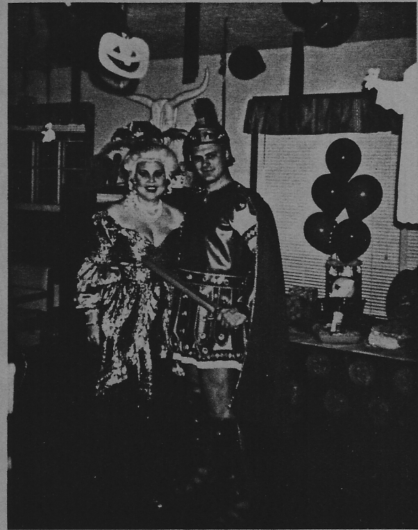
Annual Halloween Party Boy was it breezy.

Have a Merry Christmas and a Happy New Year !!!