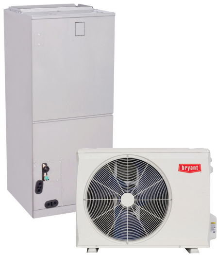
MODEL 38MURA HEAT PUMP with 40MUAA AIR HANDLER