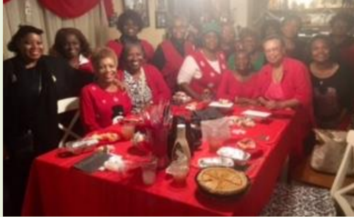
Pelati end of the year Meeting and Christmas Party

01/01/18 New Year's Day – Happy New Year