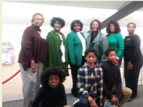
Southwestern Regional Conference 6 East Greenway Plaza Houston, (Parking $25 Daily)