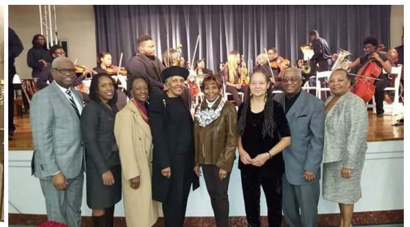
Psi Chapter Sorors and MOI at African American Museum Orchestra Event