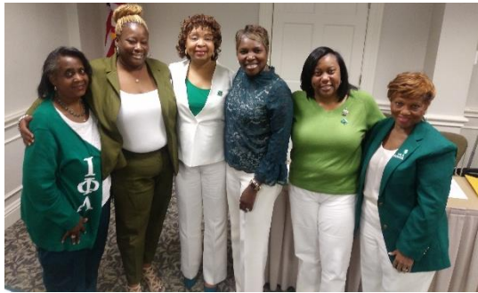
2018 Winter Line – Fundraiser Donation