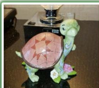
Our 1 st timers, including Shelley (our chapter turtle) dazzled at the regional conference