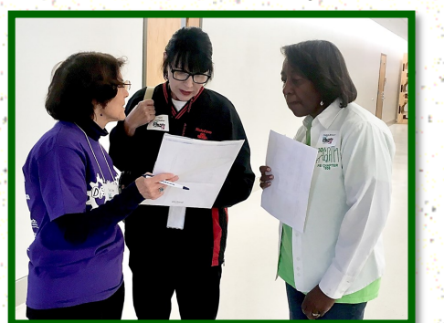
Soror Brown works with other volunteers in the plans for a STEM activity.