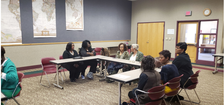
From the RUSH conducted in December 2019, Beta Psi Chapter submitted 7 candidates for membership to the Southwestern Regional Director. Beta Psi is on the move for growth and opportunity. Stay tuned!