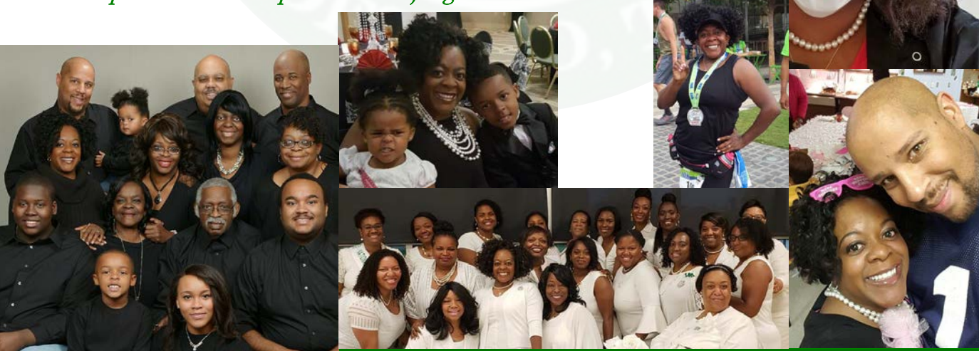
Epsilon Tau Chapter www.iota-et.org