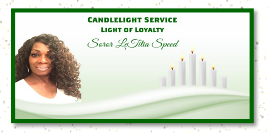
The Light of Loyalty Soror LeTitia Speed