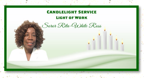
The Light of Work Soror Rita-White Ross