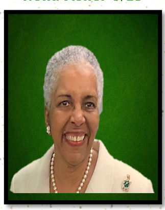
Sorors' July Birthdays