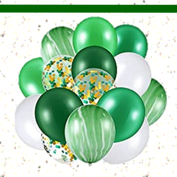
Lalanii Jones 6/26