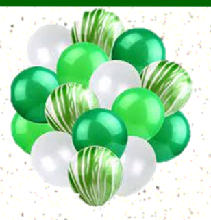
Rosma Newell 6/6