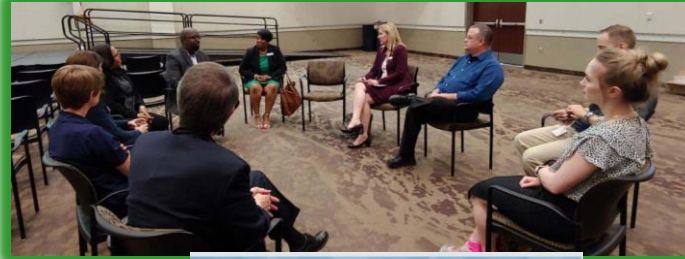
Pathways to Hot Careers in Cybersecurity and Workforce Development Tuesday, April 23 4:30-6:30 p.m. Frisco Campus Conference Center