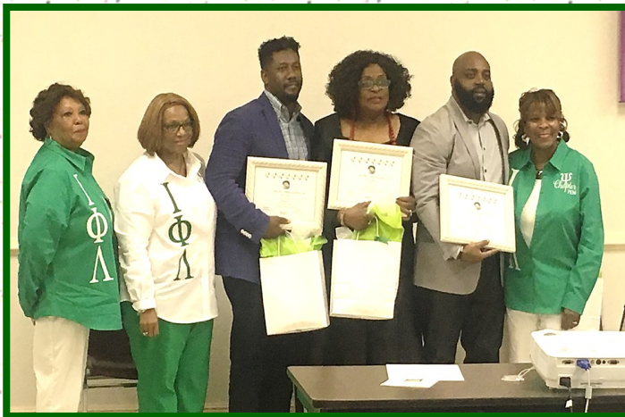
SORORS PRESENTED CERTIFICATES TO OUR GUEST SPEAKERS