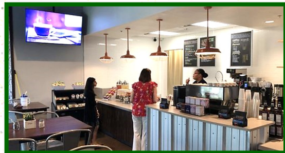
Psi Chapter Sorors dined at the CitySquare Cafe. this cafe is designed as a training ground in the field of culinary, to help fight poverty