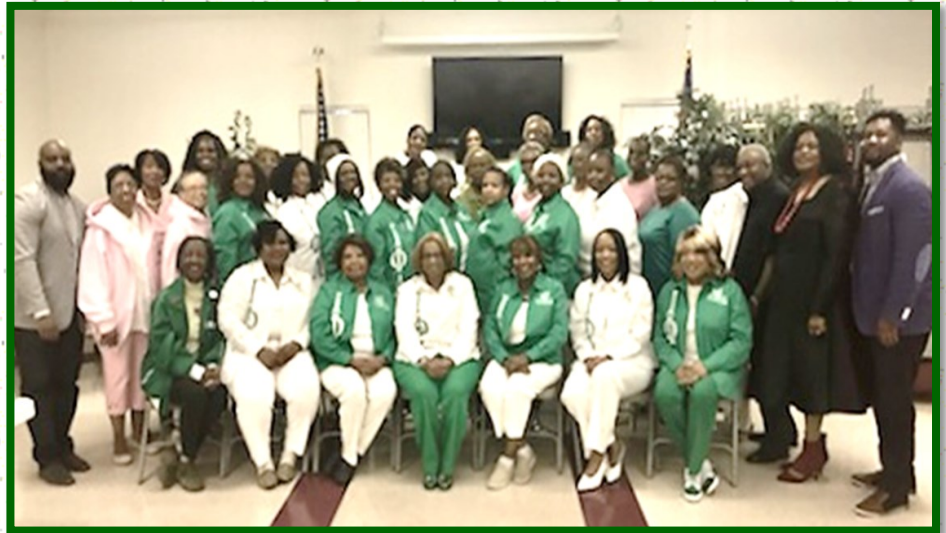
Sorors, Pelatis, MOI and Guest Speakers