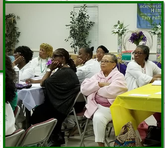
ALL EYES ARE ON THE SPEAKER