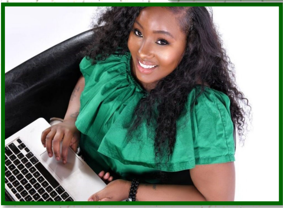
CONNECTING WITH SCHOOL AND WORK