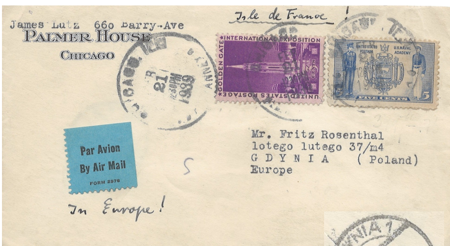
Figure 1. Cover from Chicago, IL, to Gdynia, Poland on February 21, 1939. The eight cents postage paid the UPU surface rate from Chicago to France plus airmail from France to Poland. The inset shows the March 4, 1939, received postmark from Gdynia.

Certainly, these are two fascinating letters to Europe with a seldom-seen postal rate!