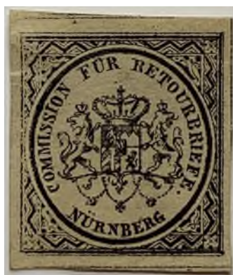
Figure 4. Nürnberg Retourmarke .