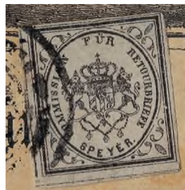
Figure 3. Cropped image of Speyer Retourmarke on German periodical.

Figure 4 shows a Retourmarke from Nürnberg. Retourmarken are little known and even less collected. They are listed and priced in the Michel Germany Specialized Catalogue , which notes that forgeries exist. Michel describes the forgeries as being crudely executed on poor quality paper. In the 3 rd edition of Album Weeds , written by R.B. Eareé in 1906, he mentions the forgeries under Bavaria in Volume I. Eareé described Retourmarken as "Returned Letter Labels" but does not illustrate them or describe the forgeries, but rather dismisses the issue because they were not true postage stamps. If you collect Retourmarken, or have comments email the editor at: centonzevincent@gmail.com .