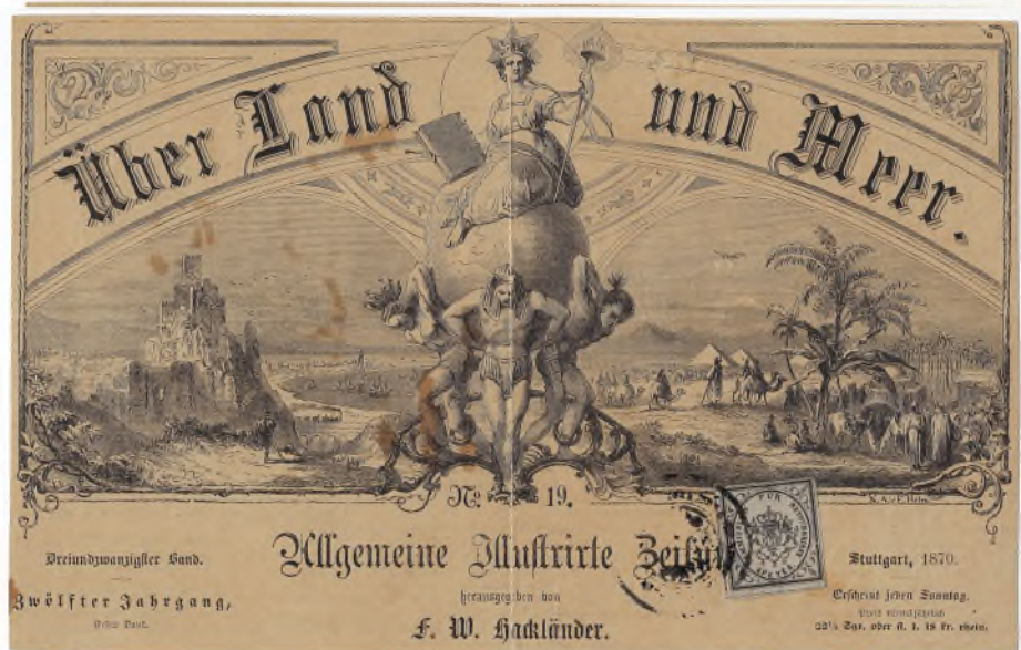
Figure 1. German periodical Über Land und Meer , with interesting

The item shown in Figure 1 is the upper half of the front page of a periodical with an interesting stamp affixed. The periodical is the German illustrated news and political magazine, Über Land und Meer (Over Land and Sea), which was published in Stuttgart, Germany, between 1858 and 1923. Like many periodicals, Über Land und Meer would likely have been sent by mail under a newspaper and periodical wrapper.