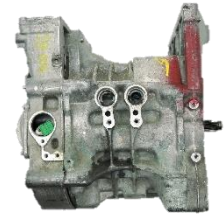
2020 Nissan Leaf