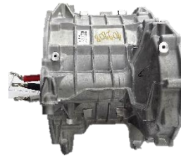
2019 Audi e-tron Front