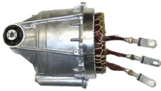
2020 Tesla Model Y Rear