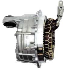
2020 Tesla Model Y Front