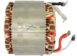
2014 BMW i3