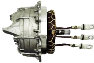
2018 Tesla Model 3 Front