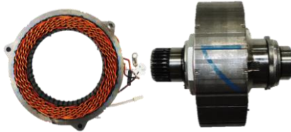
2016 Toyota Prius