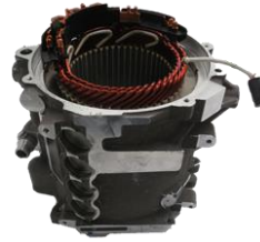
2019 Jaguar I-PACE