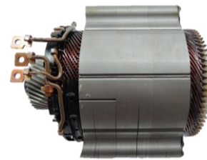
2017 Chevrolet Bolt