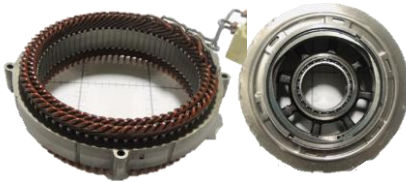
2016 Chevrolet Volt