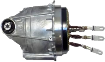
2017 Tesla Model 3 Rear