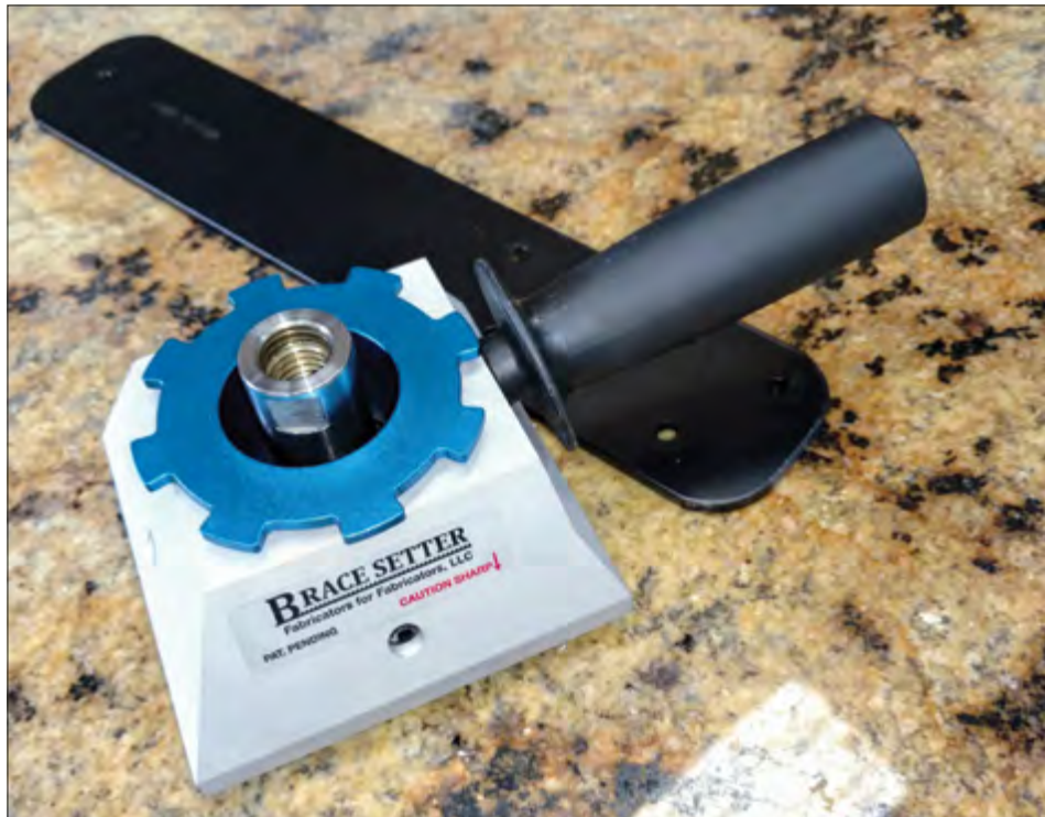
The Ioccos have designed an adjustable-depth model to cut 3/16, 1/4, and 3/8-inch deep slots for I-Braces.

“In our industry, a mistake is a very costly because a slab of granite can be quite expensive. I’ve felt the pain of breakage, like many a fabricator. That kind of mistake is devastating because you put a lot of work into it. After you go through all of this, all of a sudden you break a top and you have to do it all over again. Not only have you lost the top, you’ve lost all the fabrication and installation time.”