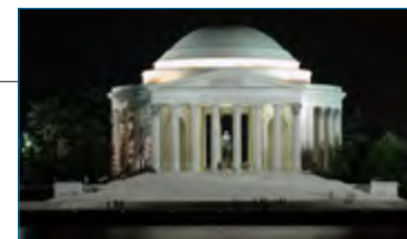
Yule marble, quarried in Colorado, was used in the Jefferson Memorial.

Geologically speaking, pure white rocks are rare. While there are many white minerals, such as quartz, feldspar, and calcite, they don't always assemble themselves into a perfectly white rock. That said, there are plenty of mostly white or nearly white stones that offer possibilities for bringing texture and geologic interest to your white countertop.