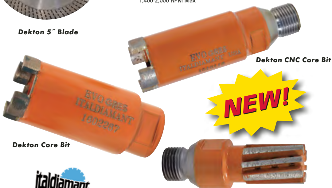
Dekton Core Bit