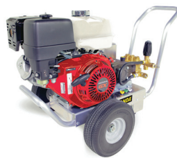
Belt-Drive HD Gas Cart