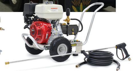
Direct-Drive HD Gas Cart with optional skid mount feet