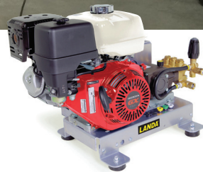
Belt-Drive HD Gas with optional skid mount feet