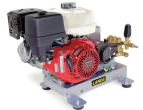
HD 4.0/40 GB shown Honda engine and optional skid-mount feet