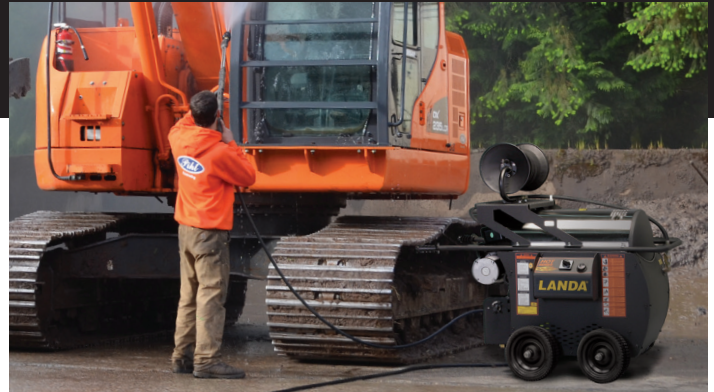
Model HOT4-20024 pictured

Simple and affordable with efficient and reliable high-pressure hot water, this series is designed for ease of operation as well as portability. Match the HOT performance and quality specifications up against any of our rivals, and you will quickly discover the value is undeniable!