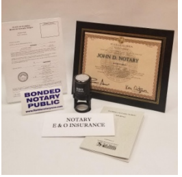
AS LOW AS 122.00