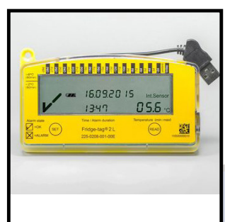
Berlinger FridgeTag2L - Fridge