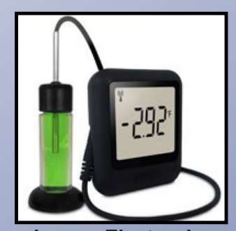
Lascar Electronics EL-WIFI-TP+-PROBE-G

Contact us today to learn more about how MicroDAQ.com can assist you with all your vaccine storage and temperature monitoring needs.