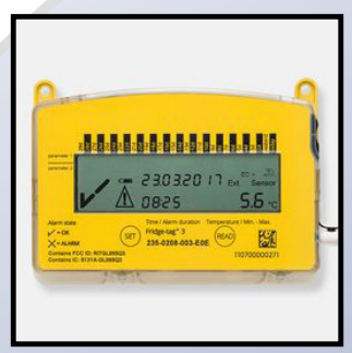
Berlinger FridgeTag 3