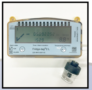
Berlinger FridgeTag2L - Freezer