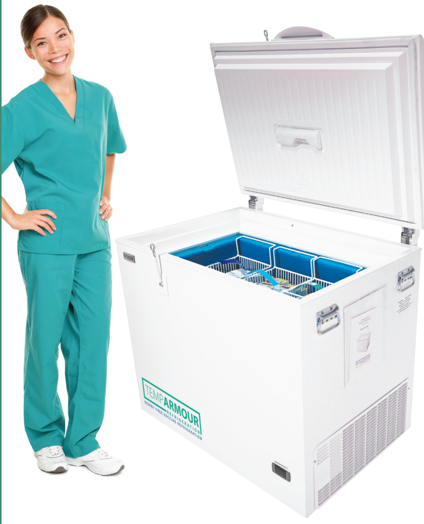
38"W x 28"L x 35"H

Large Capacity - Holds up to 2000 doses*, comparable to a 21ft³ upright model $3299 USD