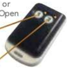
2 Channel Remote