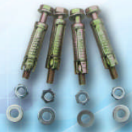
Wall Plug Package