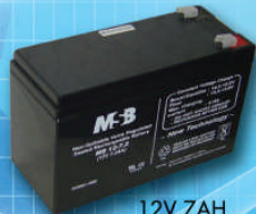
12V 7AH Battery