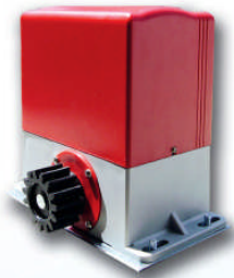
DC Sliding Motor