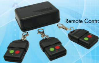
Remote Control 3+1