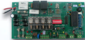
Control Panel D2