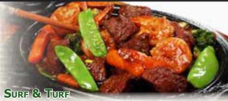
SURF & TURF