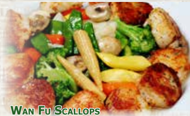
WAN FU SCALLOPS