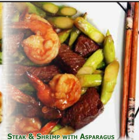
STEAK & SHRIMP WITH ASPARAGUS

*Pictured food items available from Dinner Menu only