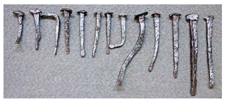
The nail sorting process and some of the conserved handmade 1762 nails from the tavern