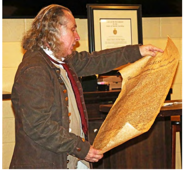
Speakers from the August and November Hinton & Polk Chapter meetings