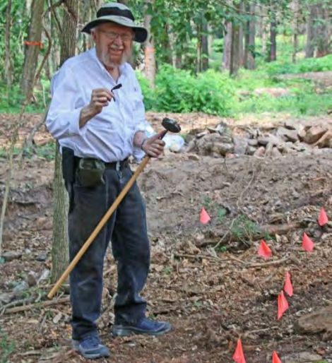
Recovering the chimney and firebox from the tavern and a wanna-be archeologist recovering a goodie

We have recovered many artifacts which are being sorted by decade of manufacture and are now being conserved.