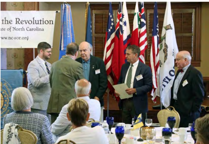
Board Meeting and Annual Member meeting with induction of new members