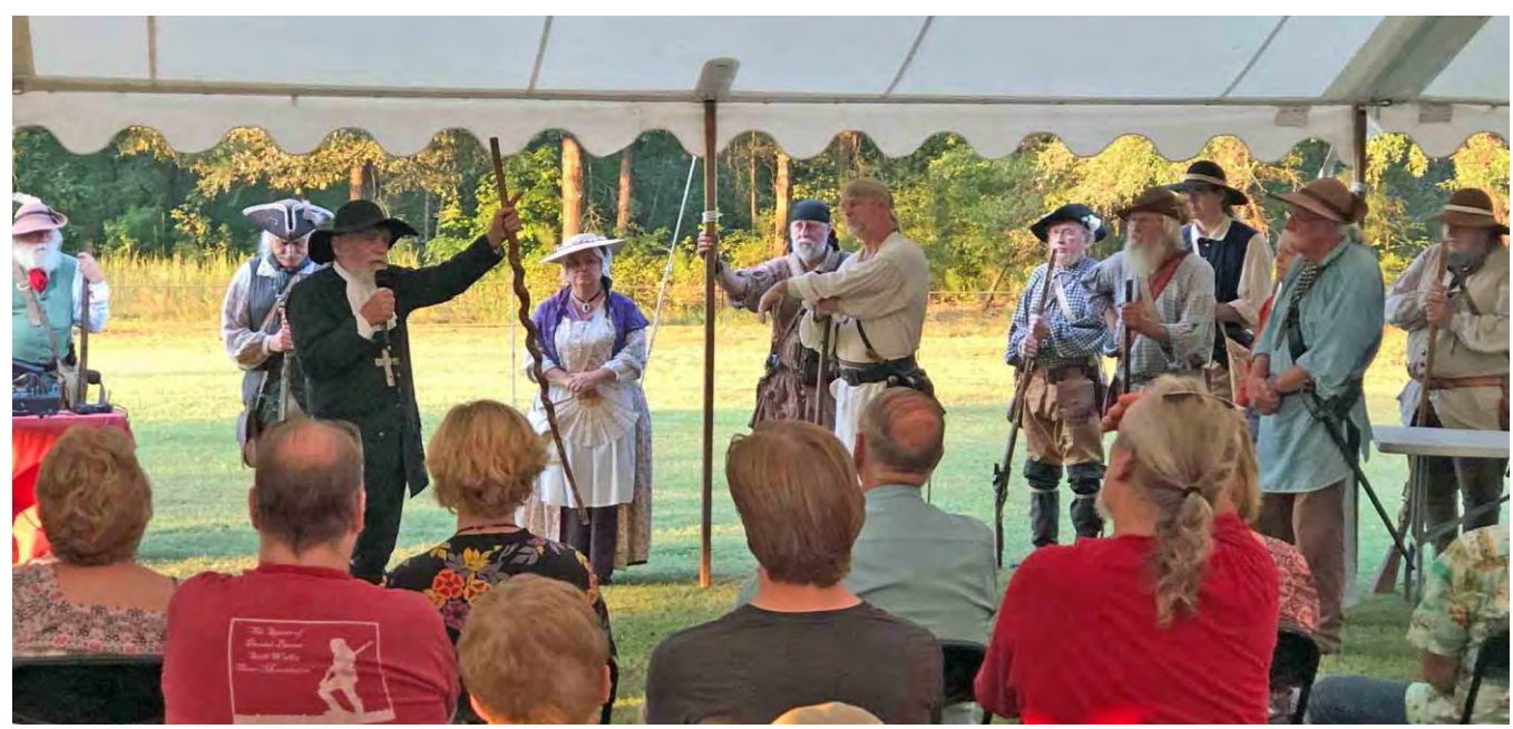
SRNC Color Guard participates in telling the Story of the March to Kings Mountain

We are a partner of the Overmountain Victory Trail Association (OVTA) and our color guard participates in the annual re-enactment of the march to Kings Mountain. The OVTA reaches over 15,000 fourth and fifth grade students with the story of the Revolution during a two week long re-creation of the march to Kings Mountain with daily living history programs. The OVTA pays for the school bus drivers and gas to ensure the thousands of kids in the four state area of the march get to attend the living history of the Revolutionary War presented by the OVTA. The SRNC contributes funds for the event.