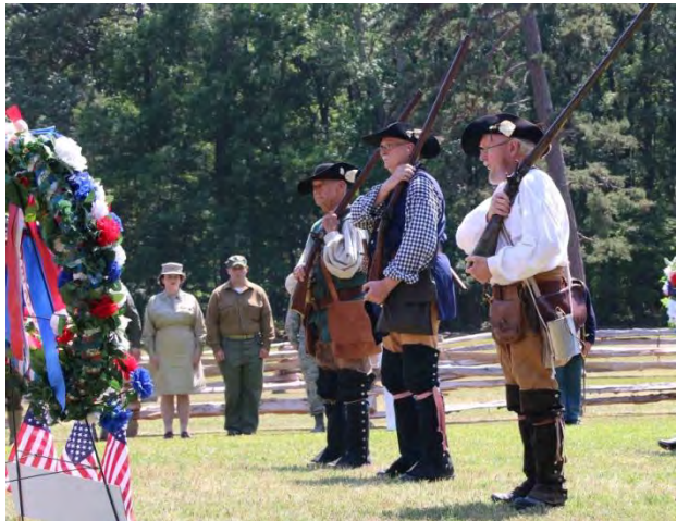
SRNC leading the parade and Laying a wreath at NC State Historic Site Bennett Place