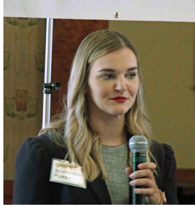
This year's Scholarship Winner