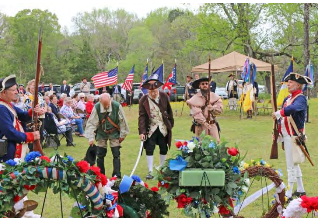
Halifax Resolves Wreath Laying and giving Greetings in Halifax, NC. April 12, 2019