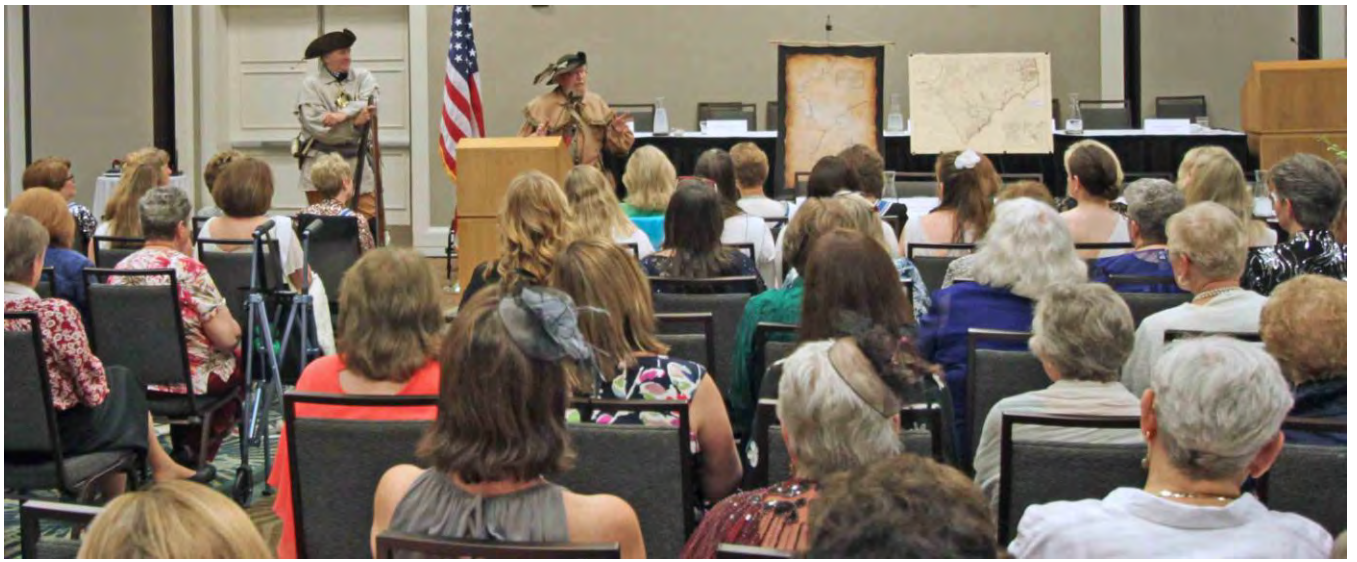
Presentation to the DAR State Convention held in Raleigh