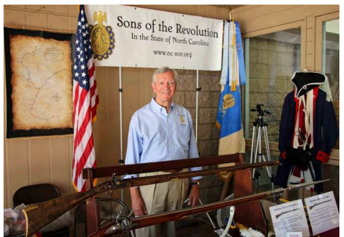
SRNC Color Guard firing a volley and our recruiting Booth on Memorial Weekend 2019