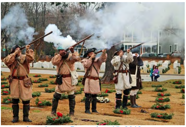
Wreath laying and volley at Wreaths Across America on December 15, 2018