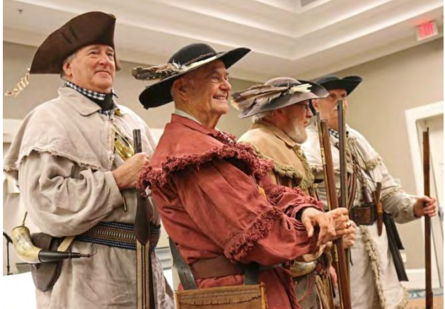
Program and display at the Polk Co. Museum and Presentation to DAR State Convention