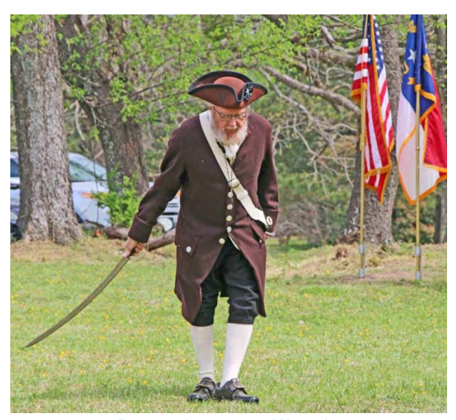
Presenting at our Wreath