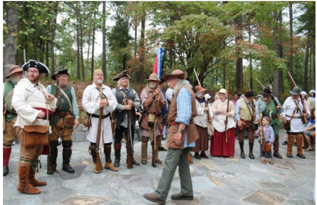
A scrufty lookin bunch of patriots

We had a march up the mountain with a wreath laying at the top. This year there were over 150 wreaths from organizations as far away as Alaska.. That is an all time record. The afternoon program was held indoors due to the rain.