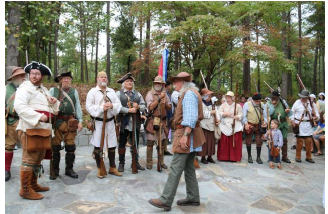
A scruffy lookin bunch of patriots

We had a march up the mountain with a wreath laying at the top. This year there were over 150 wreaths from organizations as far away as Alaska.. That is an all time record. The afternoon program was held indoors due to the rain.