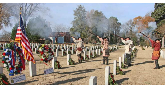
Firing a volley