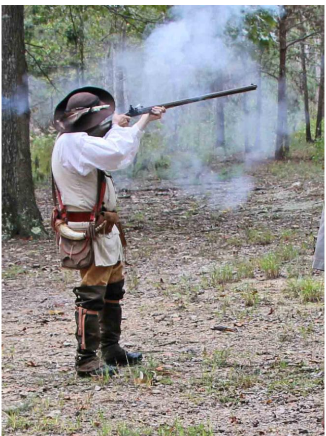
Loading and firing the firelock for a demonstration