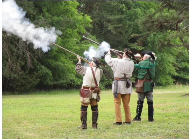
Wreath laying and volley firing at the Battle of Alamance 250<sup>th</sup> Anniversary Commemoration