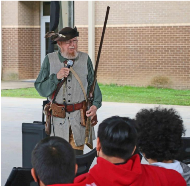
Presenting to Rutherford County Elementary school