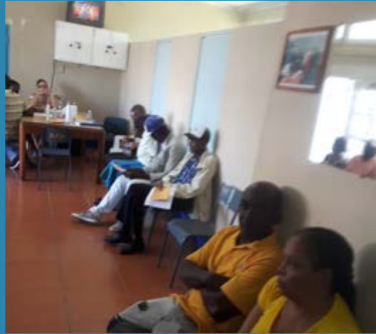
Princess Margaret Hospital Waiting room