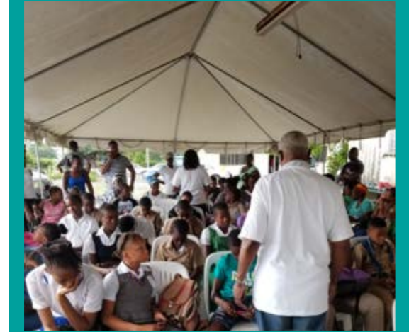
Shaded Open-air Waiting Area