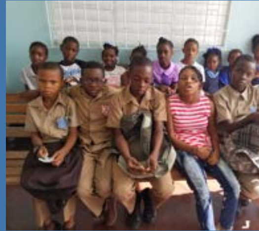
School Children Invited for Screening