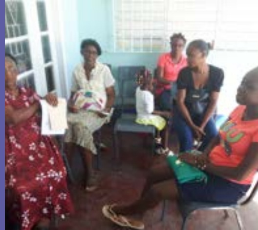
Patiently Awaiting Screening