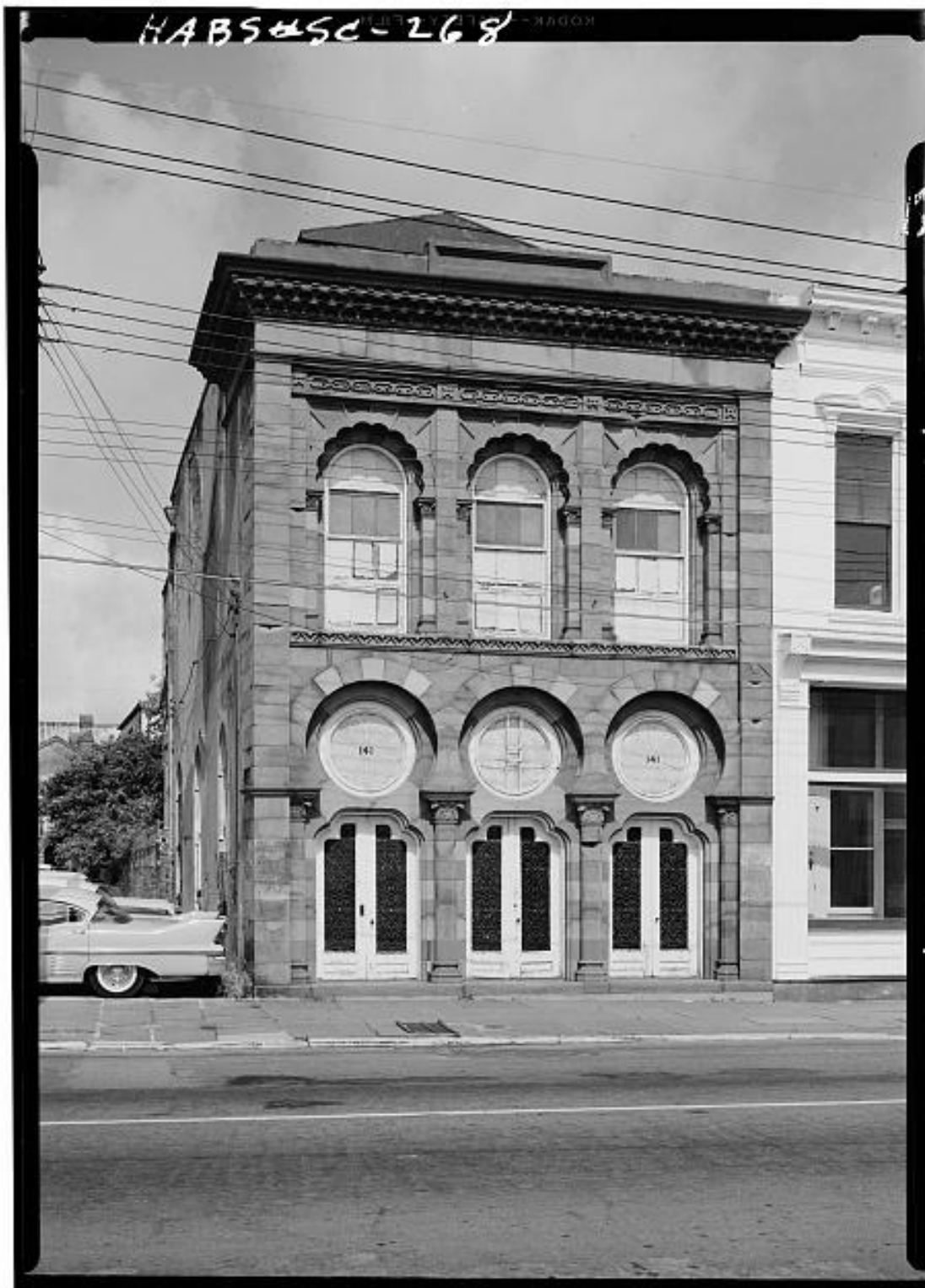
The Farmers and Exchange Bank 141 East Bay Street