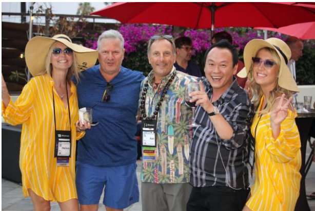
2018 Beach Party

Join us for our Hipsters Dinner & Dueling Pianos event on Wednesday evening. In case you missed our Beach Party last year, our evening parties are a lot of fun. Get ready to hear all your sing-along songs in an outdoor setting overlooking the gorgeous golf course - food, drinks and fun included!