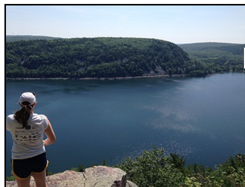
WEST BLUFF, DEVIL'S LAKE