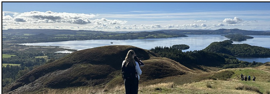
View of Loch Maree from Conic Hill

Google search: There are multiple tour and ticket options to book in advance (optional)