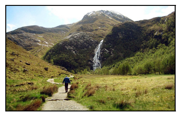
"Carry as little as possible, but choose that little with care."

SCOTLAND: I am excited to announce that trip assignments have been made and the list will be mailed soon to all Scotland participants.