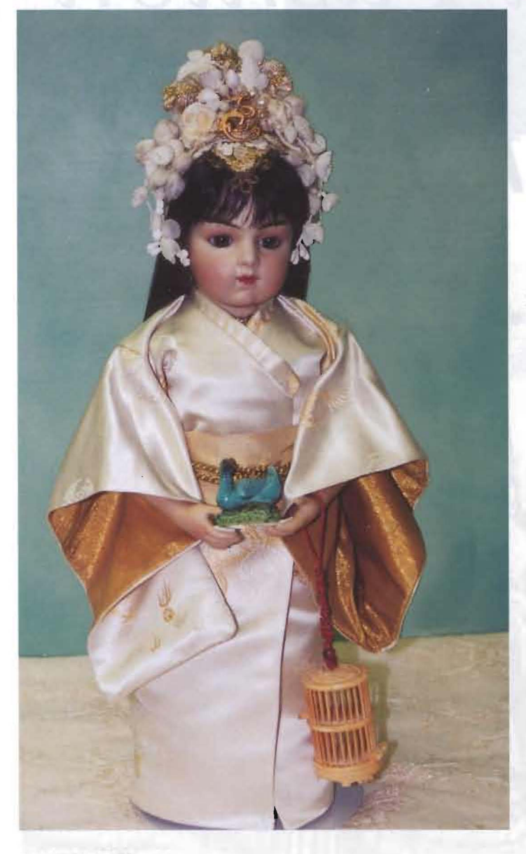
by Darlene Lane

The original Oriental Bru was painted with two different techniques, one being the oriental wash with exotic eyebrows, the other with the traditional Bru look. Both were dressed in kimono.