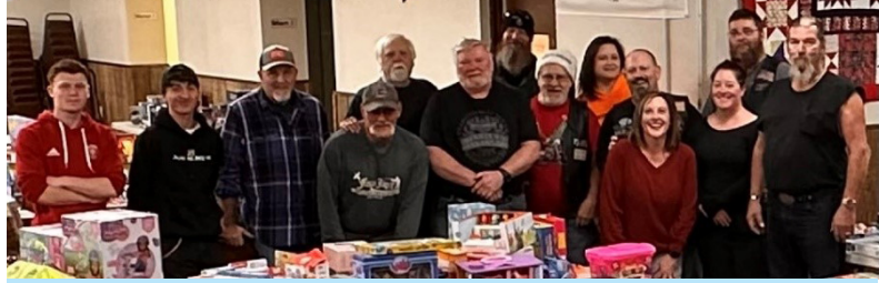
Sanford American Legion Post 443 Legion Riders 12th Annual Toyz for Kidz event raised over $8000.00 in toys and gift cards to support Midland County schools.