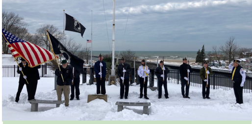
South Haven Post 49 conducted a Pearl Harbor Day Remembrance Ceremony, with a 3 volley salute, taps and launching of the Commemorative Wreath