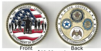
Front $10.00 each Back

Supporting Paralyzed Veterans in Michigan with spinal cord injuries, and to help Veterans regain independent living.