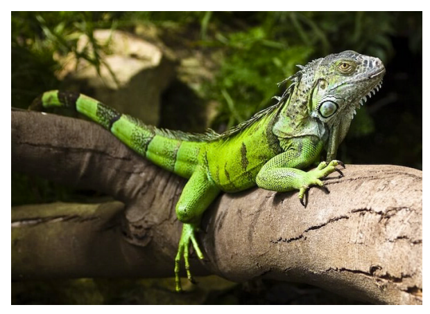
Green and spinytail iguana