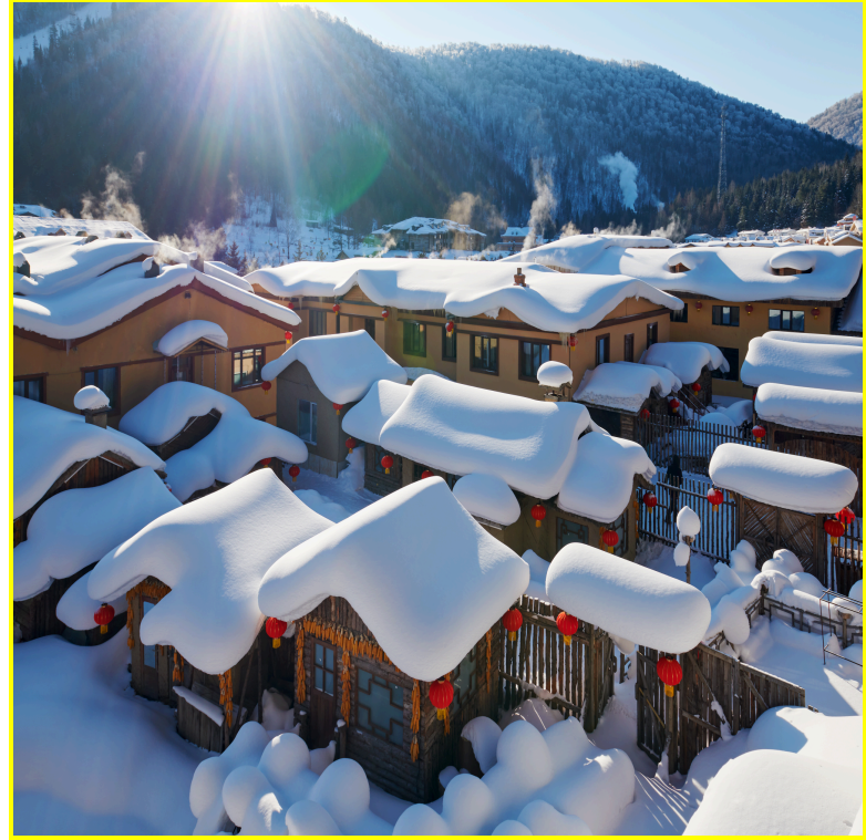
YABULI SNOW VILLAGE