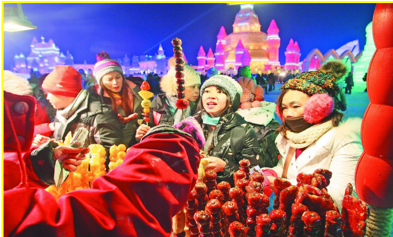
WORLD OF SNOW AND ICE