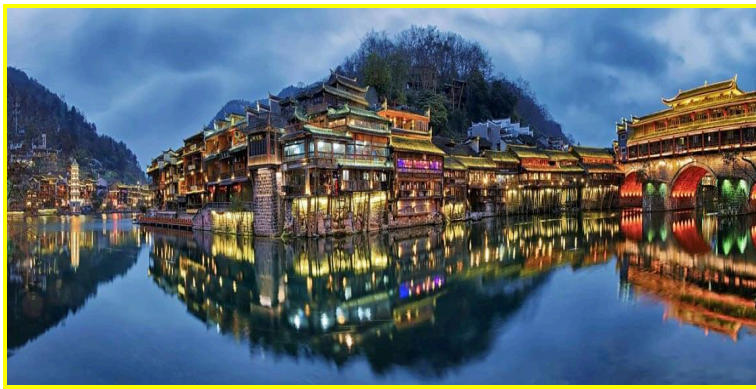
Furong Ancient Town