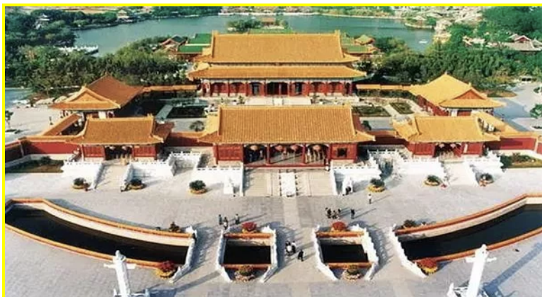
NEW YUANMING PALACE