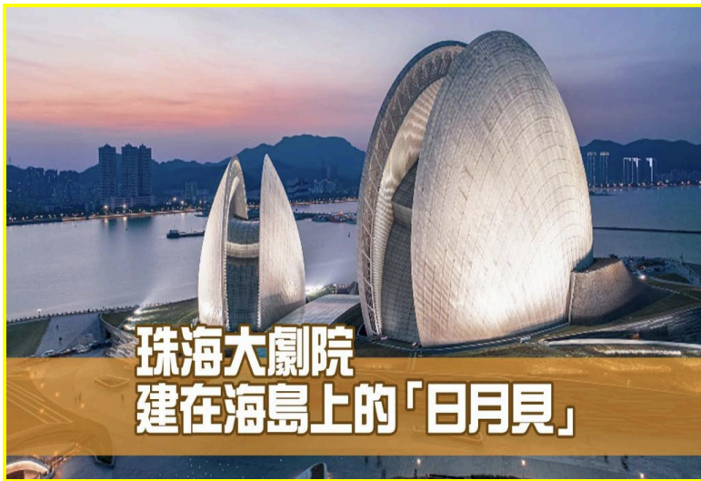
ZHUHAI GRAND THEATRE