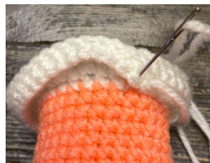
Image shows needle through the top loops of R50 going into the space between R46

Slst in the next 2 sts, fasten off leaving a longtail for sewing the mouth piece to the shaft.