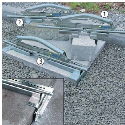
1. PPH-10/37, 2. PPH-22/50, 3. PPH-33/62, bottom: PPH-AA