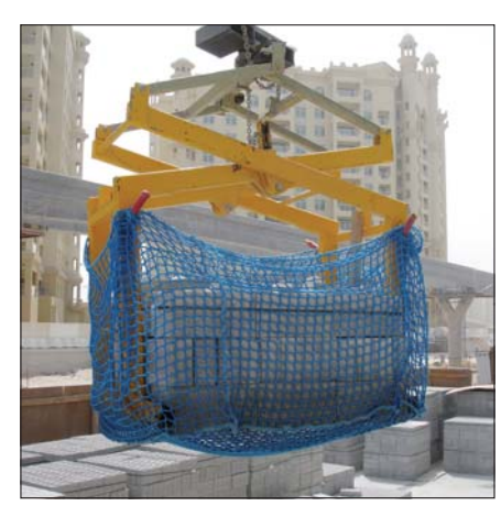
SG - Picture as an example