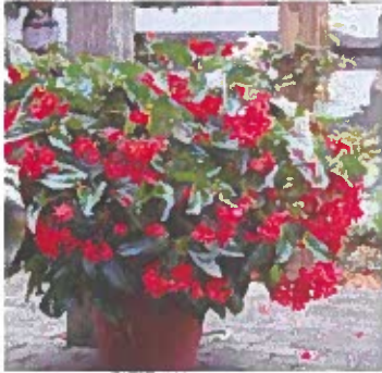
# 11 Dragon Wing Begonia Red Flowers. Fast grower with lots of color