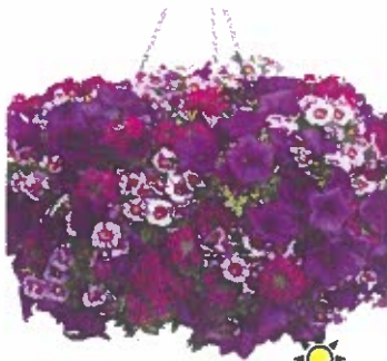
# 8 Ada Evening Star Cali, Royal Velvet Petunia, Plum Verbena