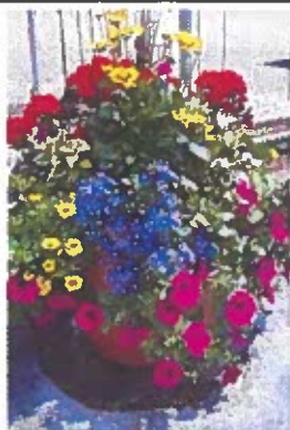
Patio Planter # 17 Large 14" $42.00 # 18 Small 10" $32.00 Decorative pot full of color