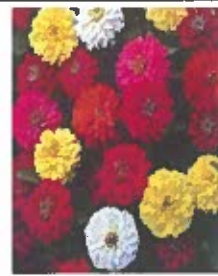
#20 Zinnia Basket $13.00 6 Zinnias in 3 1/2" pots Mixed Colors