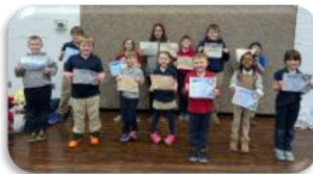
2 nd Quarter Award Winners