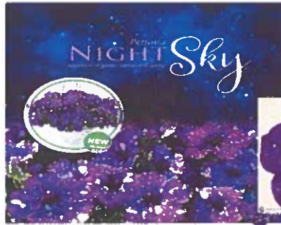
#12 Night Sky Petunia Dark Blue with white speckles