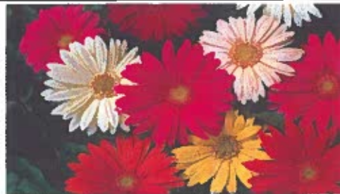
# 7 Gerbera Daisy Bright Colors , great for pots Or Gardens