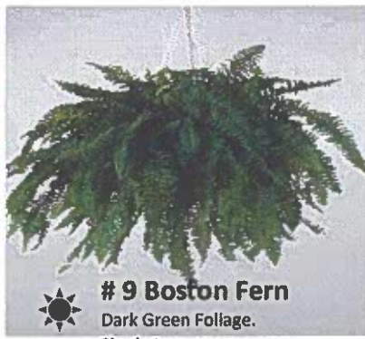
# 9 Boston Fern Dark Green Foliage. Shade Lover