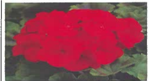
Bedding Geranium Flat

18 Plants—New size this year. Larger plants