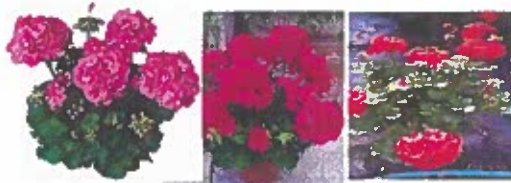
Zonal Geranium - #4 Red, # 5 Pink , # 6 Purple Taken from cuttings / Large Double Blooms