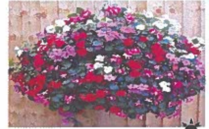
# 13 Mixed Impatiens Bright colorful blooms . Great for a shady spot