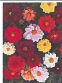
# 19 Dahlia Basket Figaro Double $13.00 6 Dahlias in 3 1/2" pots Mixed colors. Grows 14-18"